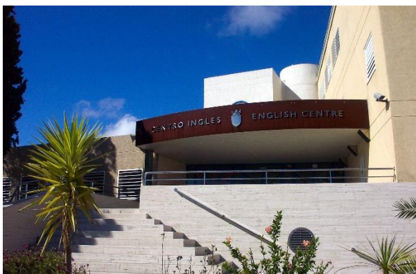
The school building