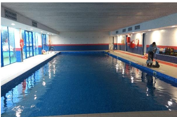
Indoor swimming pool