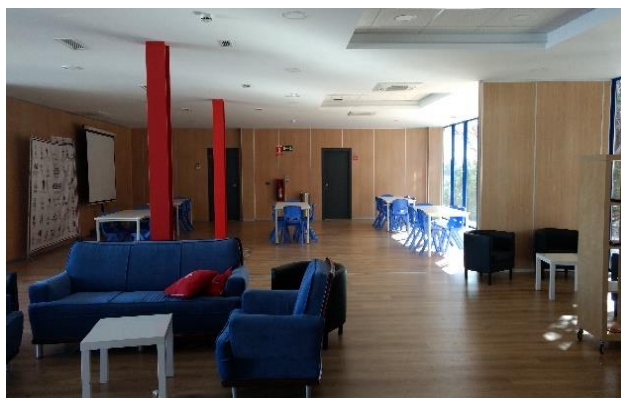
A chill-out area for bachillerato students